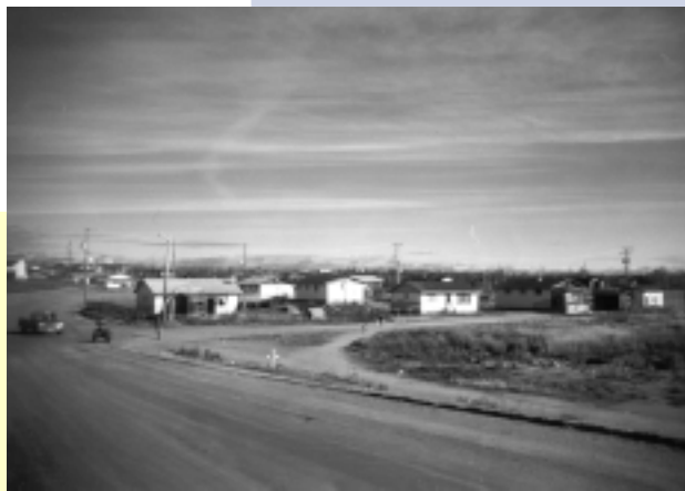
Fond du Lac -- October 2001.