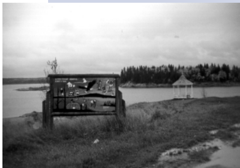
Sandy Bay, Saskatchewan -- October 2001.

3rd Floor, 1942 Hamilton Street Regina, SK S4P 3V7 Phone 1-800-667-8577